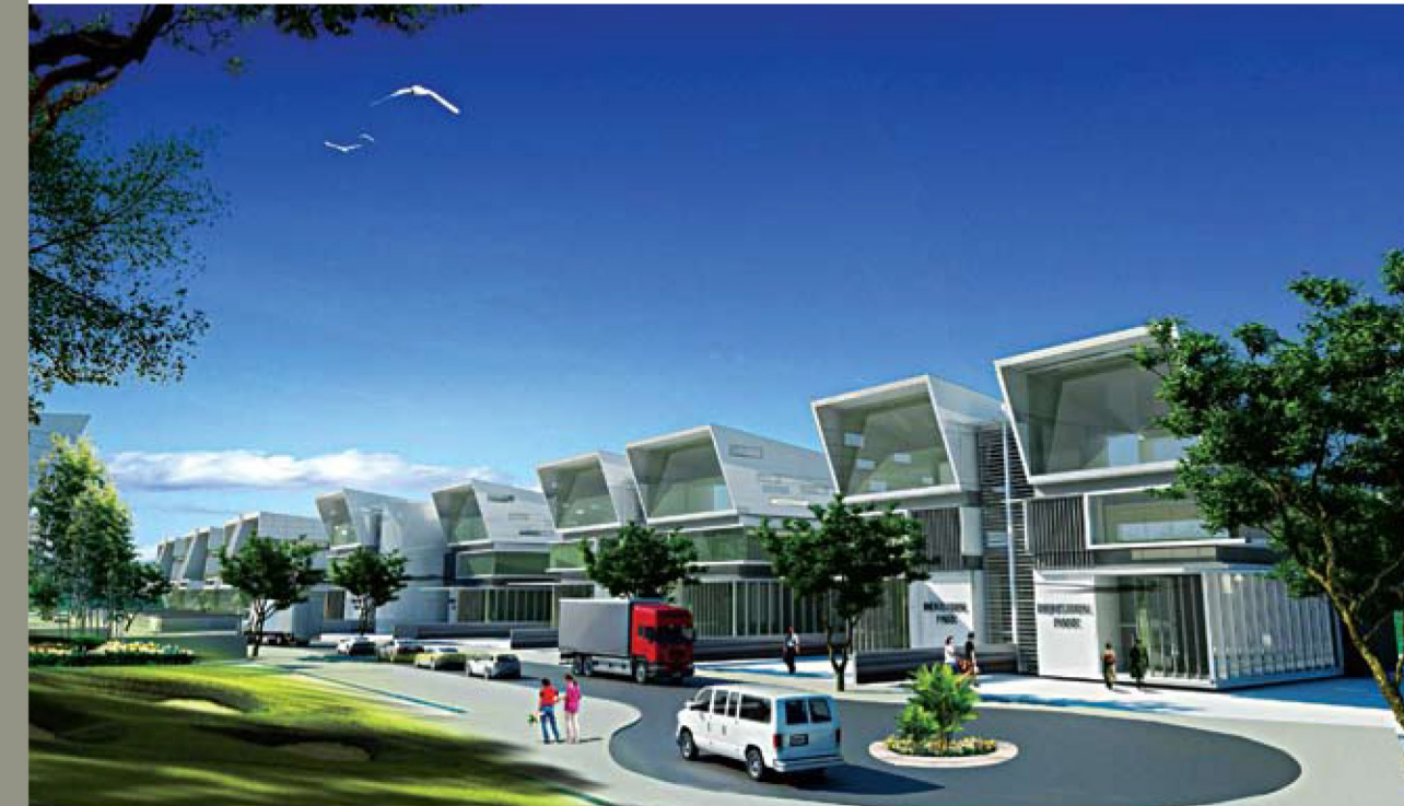
TIONG NAM INDUSTRIAL PARK • PJ