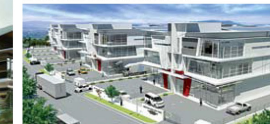
TIONG NAM INDUSTRIAL PARK • SHAH ALAM