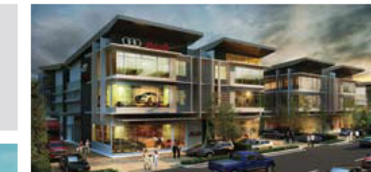
TIONG NAM INDUSTRIAL PARK • KEMPAS, JB