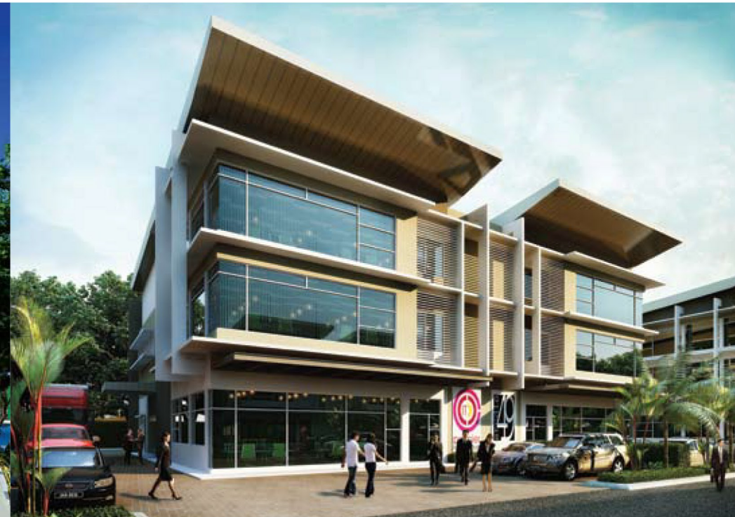
TIONG NAM INDUSTRIAL PARK • KEMPAS, JB