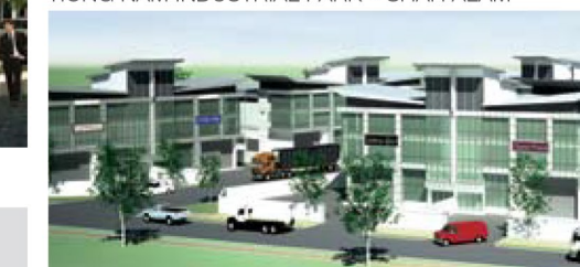
ALAM PREMIER INDUSTRIAL PARK