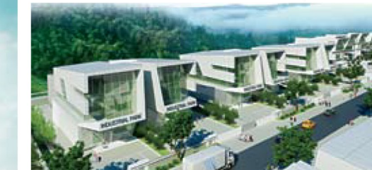
TIONG NAM INDUSTRIAL PARK • PJ